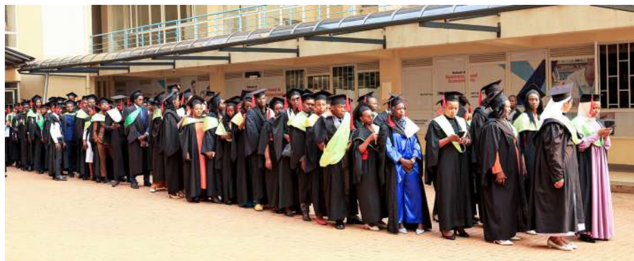
Jubilant graduands during the procession walk. More than 1,200 students graduated.