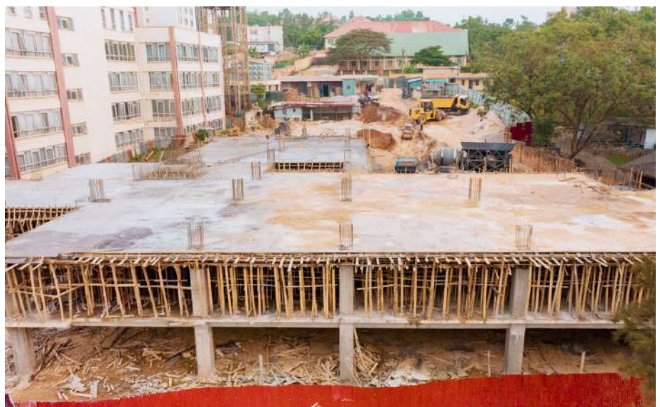
A new tuition block under construction

Dr Kimemia said the university is also investing in infrastructure that promotes a conducive learning environment. A new student housing block is currently under construction, and it will feature modern accommodation, a cafeteria, and common areas designed to encourage community and collaboration. In addition, plans are underway to acquire more land to expand hostel capacity and meet the growing demand for on-campus student accommodation.