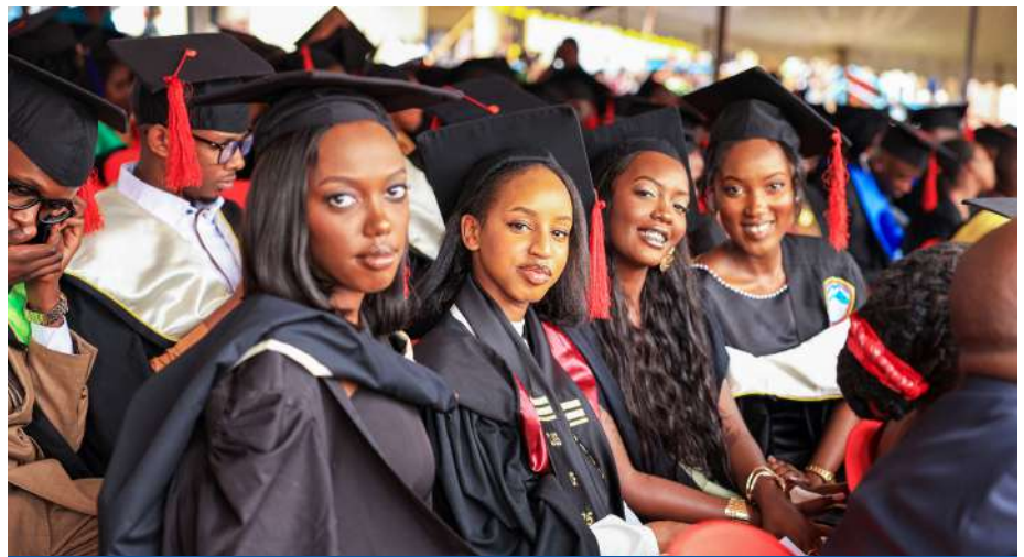
Happy faces of Graduands. This year’s cohort was notable for its strong female presence.